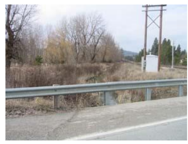
Figure 21: Bridge along Bowdish Road. Looking downstream from bridge