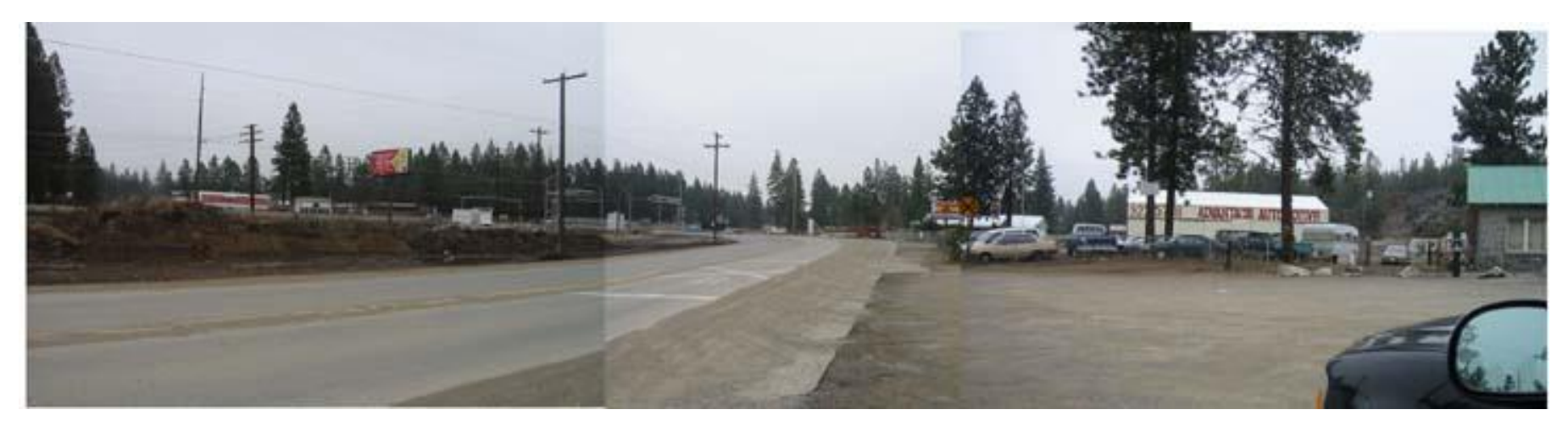
Figure 2: Dishman Road/Dishman-Mica Road/Eight Avenue Intersection. Looking upstream at intersection