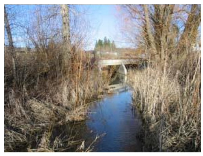
Figure 31: Dishman-Mica road crossing. Looking at upstream bridge face