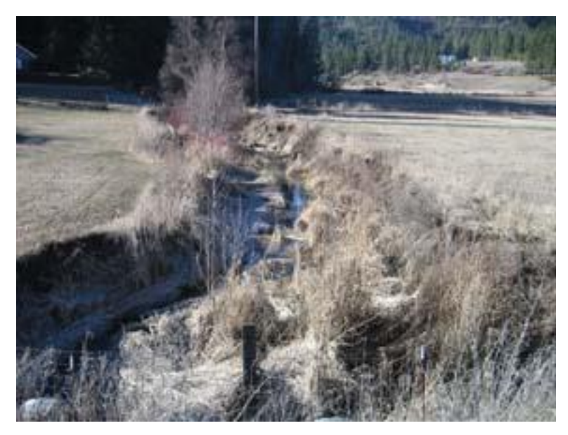
Figure 45: Chester Creek Lane. Looking upstream from road