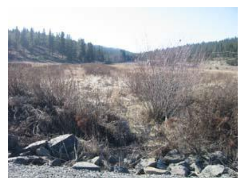
Figure 59: 46th Avenue. Looking upstream