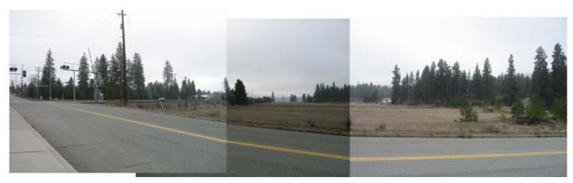
Figure 3: Dishman-Mica Road/ 16th Avenue Intersection. Looking upstream from 16th avenue