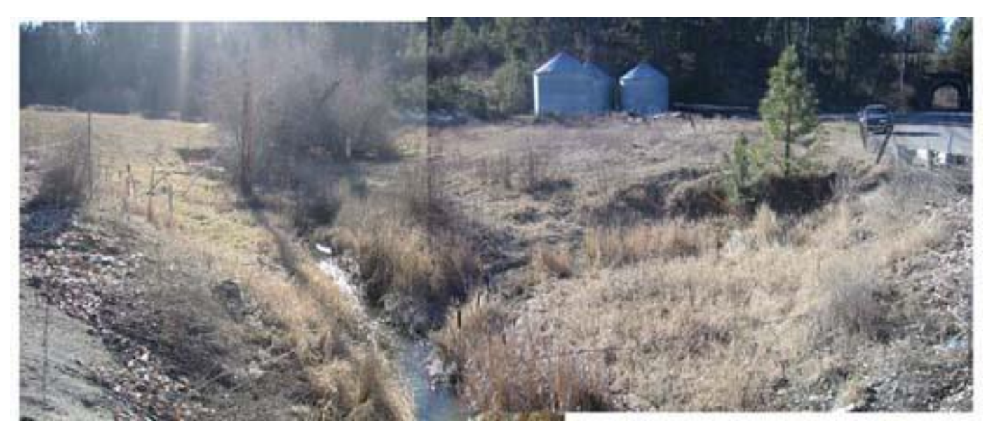
Figure 58: Dishman/Mica Road. Looking at upstream channel