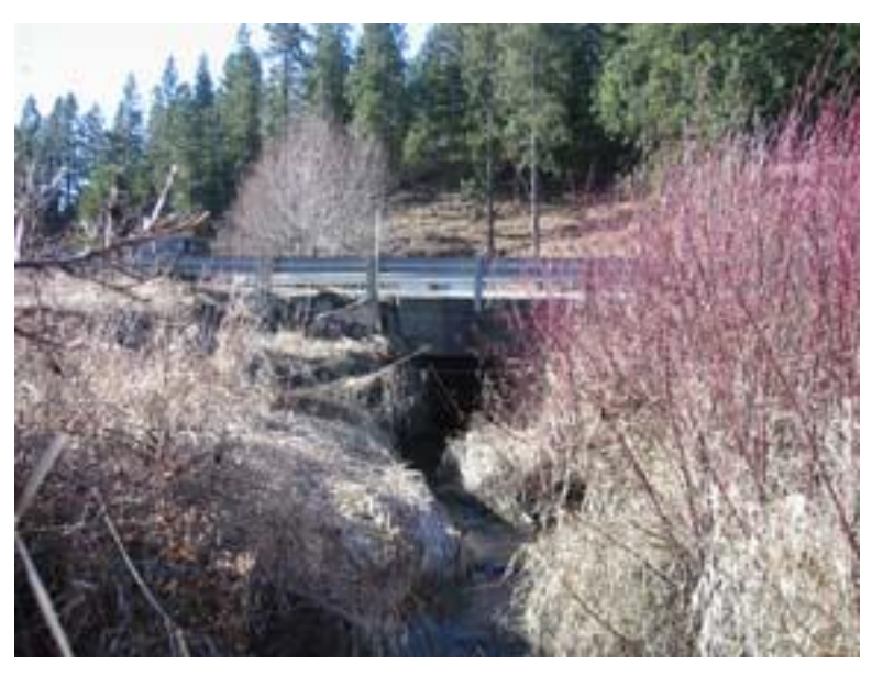
Figure 51: Dishman/Mica Road. Looking at downstream bridge face