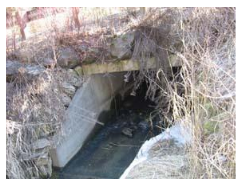
Figure 54: Dishman/Mica Road. Looking at downstream bridge face