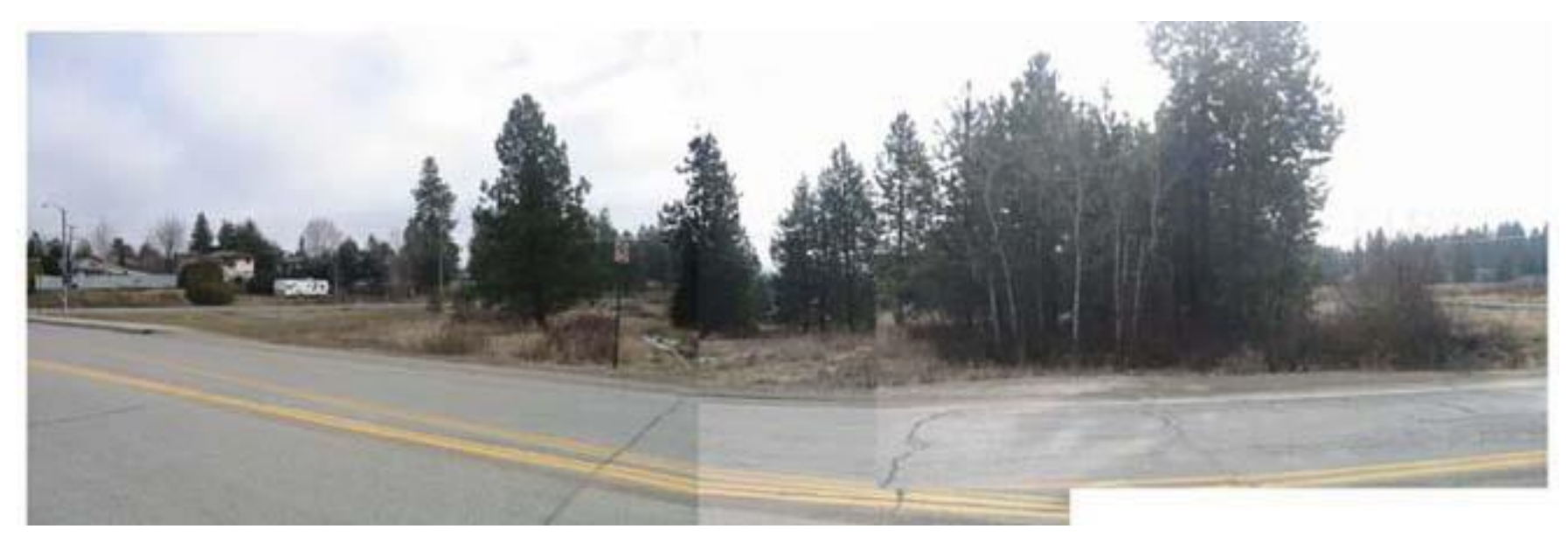
Figure 9: Dishman-Mica Road/ Schafer Road. Looking upstream from Schafer road