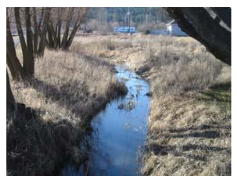
Figure 34: Footbridges on golf course. Looking upstream from upstream footbridge