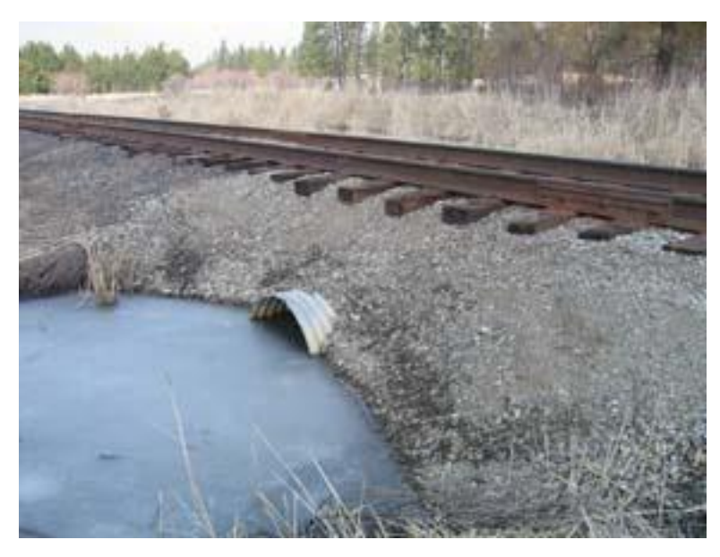
Figure 18: Culvert under railroad between Schafer and Dishman/Mica