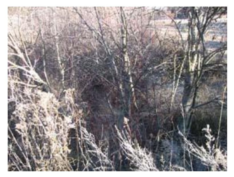
Figure 42: Mohawk road. Looking downstream from road