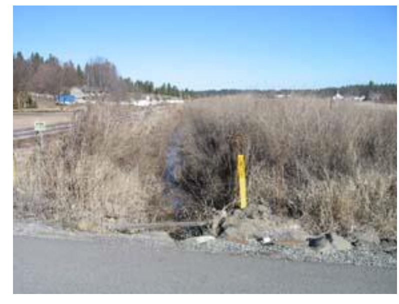
Figure 60: 46th Avenue. Looking downstream