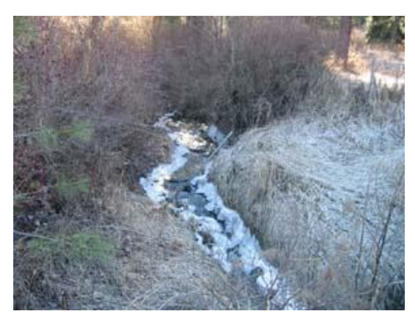
Figure 52: Dishman/Mica Road. Looking upstream