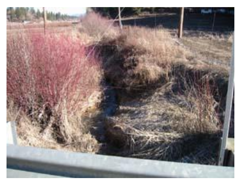
Figure 50: Dishman/Mica Road. Looking downstream