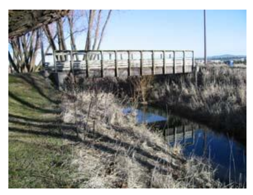
Figure 32: Footbridges on golf course. Looking at upstream face of upstream footbridge