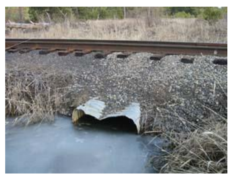
Figure 17: Culvert under railroad between Schafer and Dishman/Mica