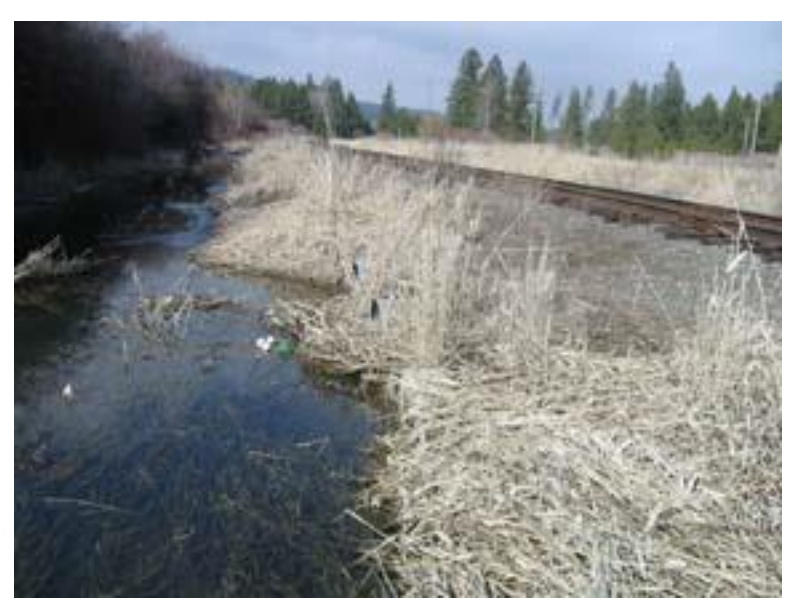
Figure 14: Culvert under railroad between Schafer and Dishman/Mica