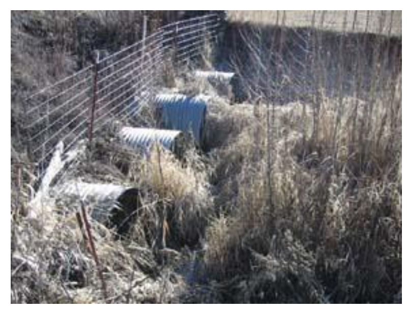
Figure 47: Chester Creek Lane. Upstream face of culverts