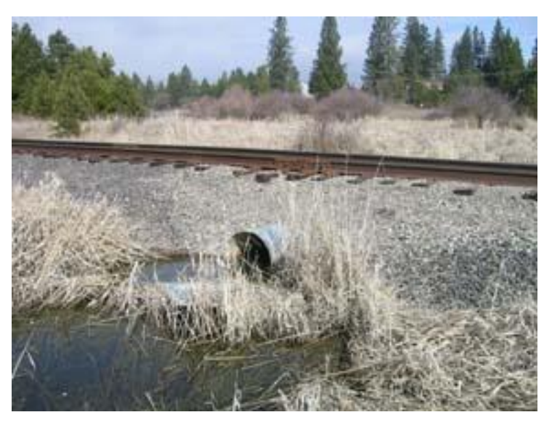
Figure 19: Culvert under railroad between Schafer and Dishman/Mica