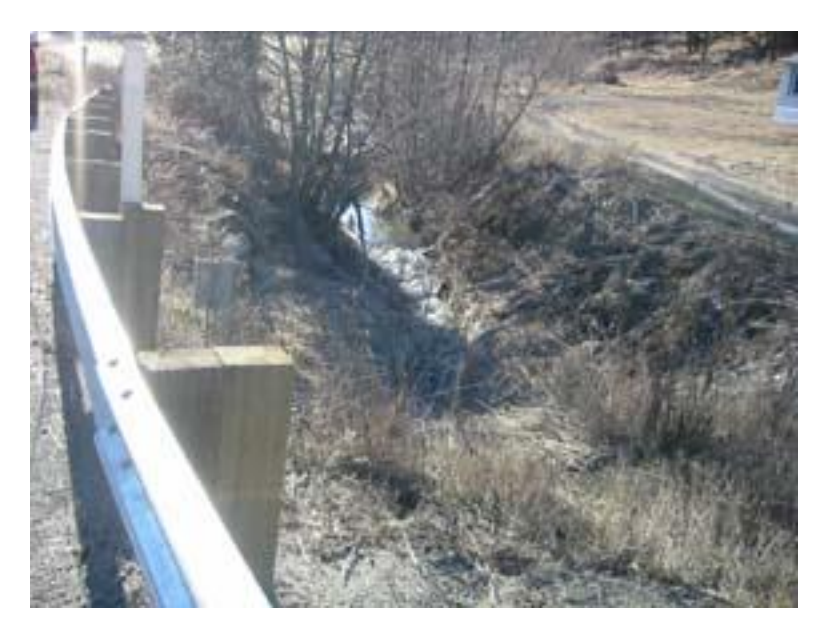
Figure 48: Dishman-Mica road. Looking upstream