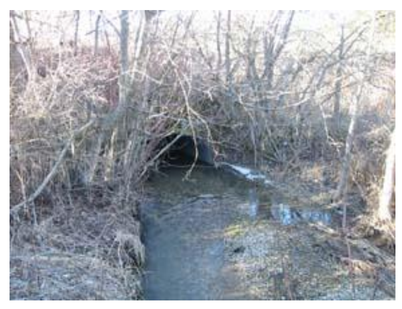
Figure 44: Mohawk road. Looking at downstream face of culvert