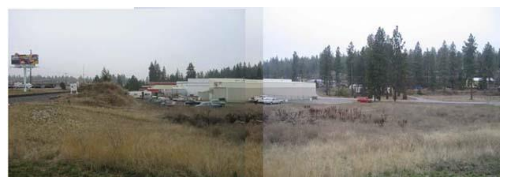
Figure 1: Dishman Road/Appleway Blvd Intersection. Looking upstream from intersection of railroad and Appleway blvd