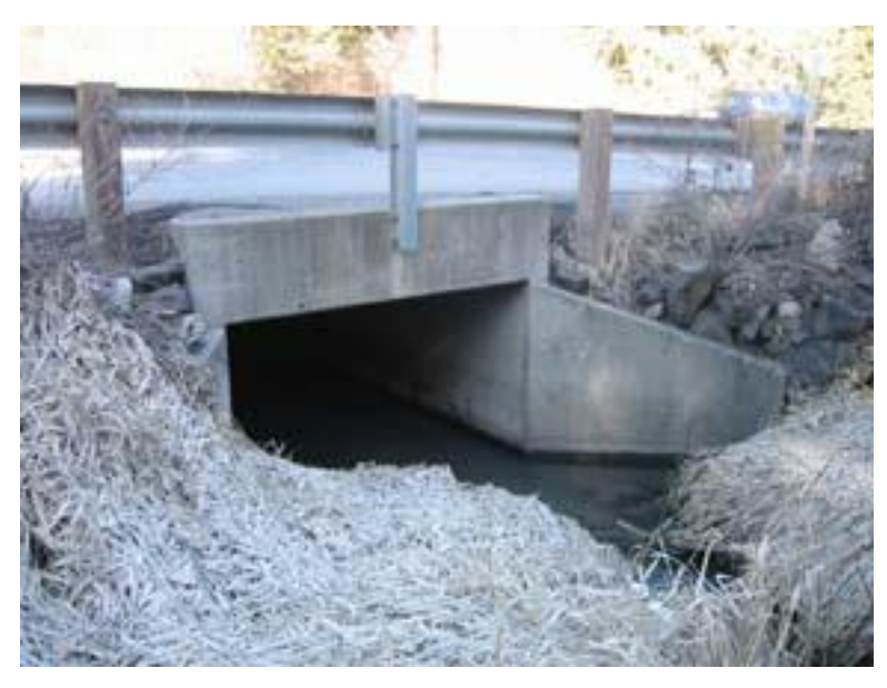
Figure 53: Dishman/Mica Road. Looking at upstream bridge face