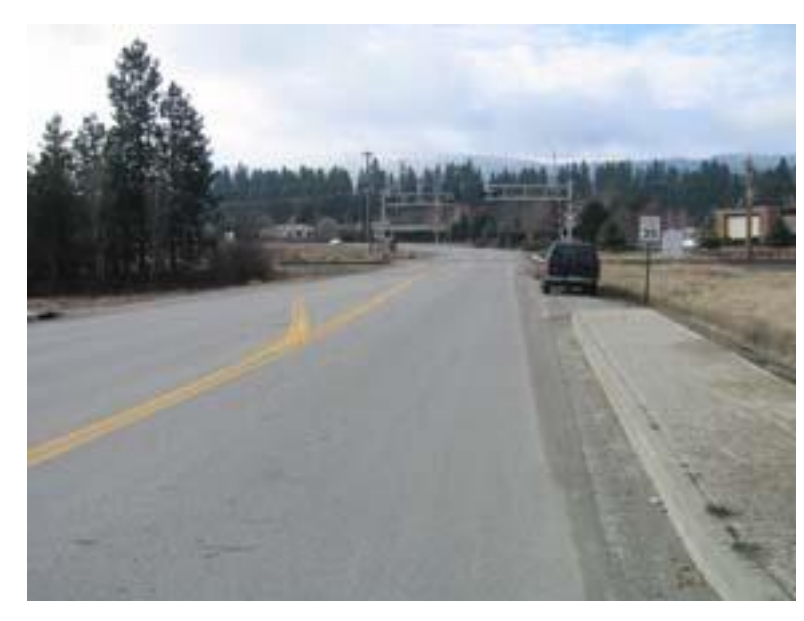
Figure 10: Dishman-Mica Road/Schafer Road. Looking towards left bank along Schafer Road