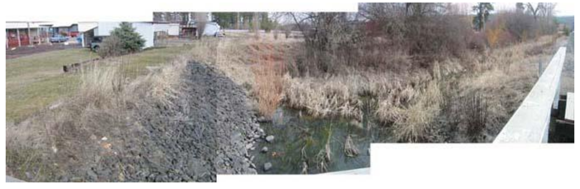
Figure 24: UPRR Bridge about 1/8 mile upstream of Bowdish Road. Looking upstream