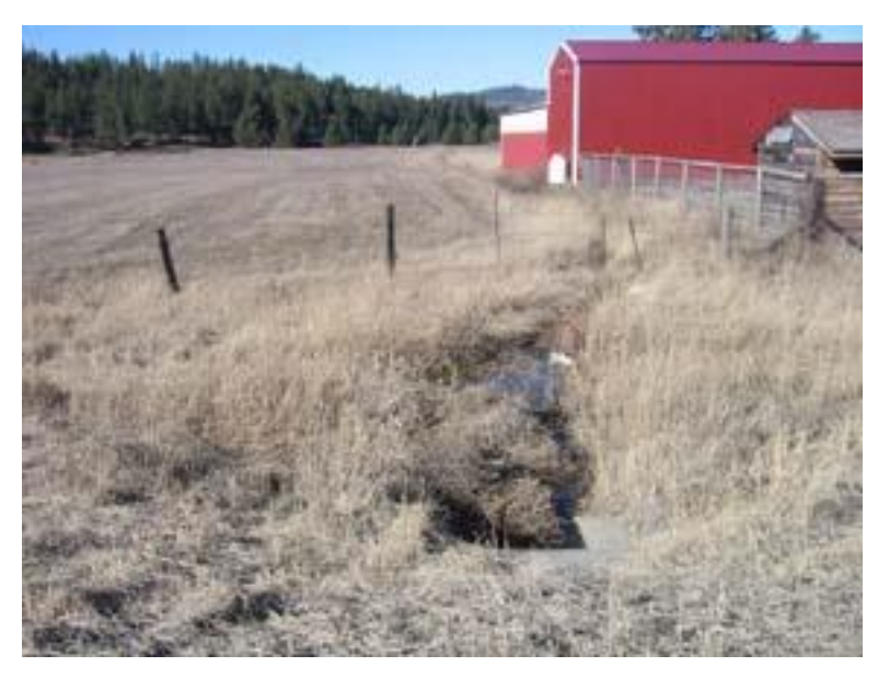
Figure 64: HWY 27 culvert. Looking along downstream channel