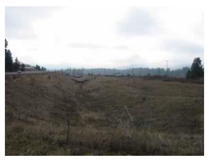
Figure 7: Dishman-Mica Road/28th Ave. Intersection. Looking upstream from 24th Ave.