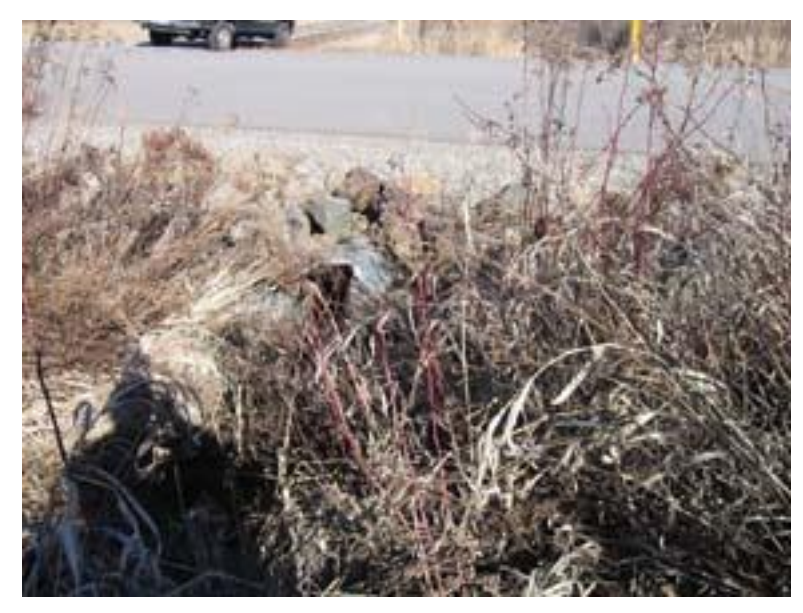
Figure 61: 46th Avenue. Looking at upstream face of culvert