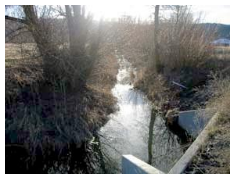
Figure 29: Dishman-Mica road crossing. Looking upstream