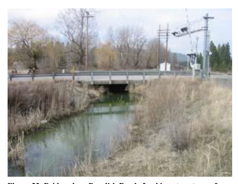
Figure 23: Bridge along Bowdish Road. Looking at upstream face