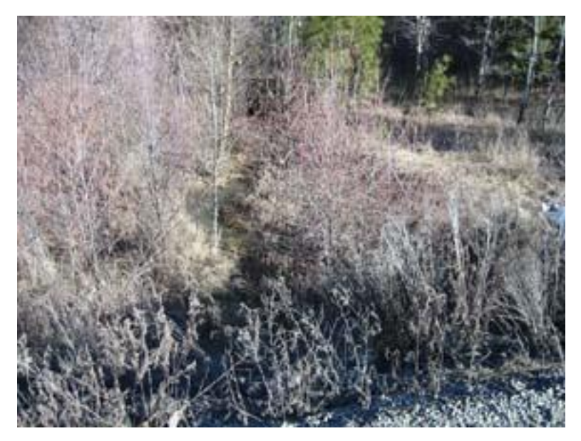
Figure 46: Chester Creek Lane. Looking downstream from road