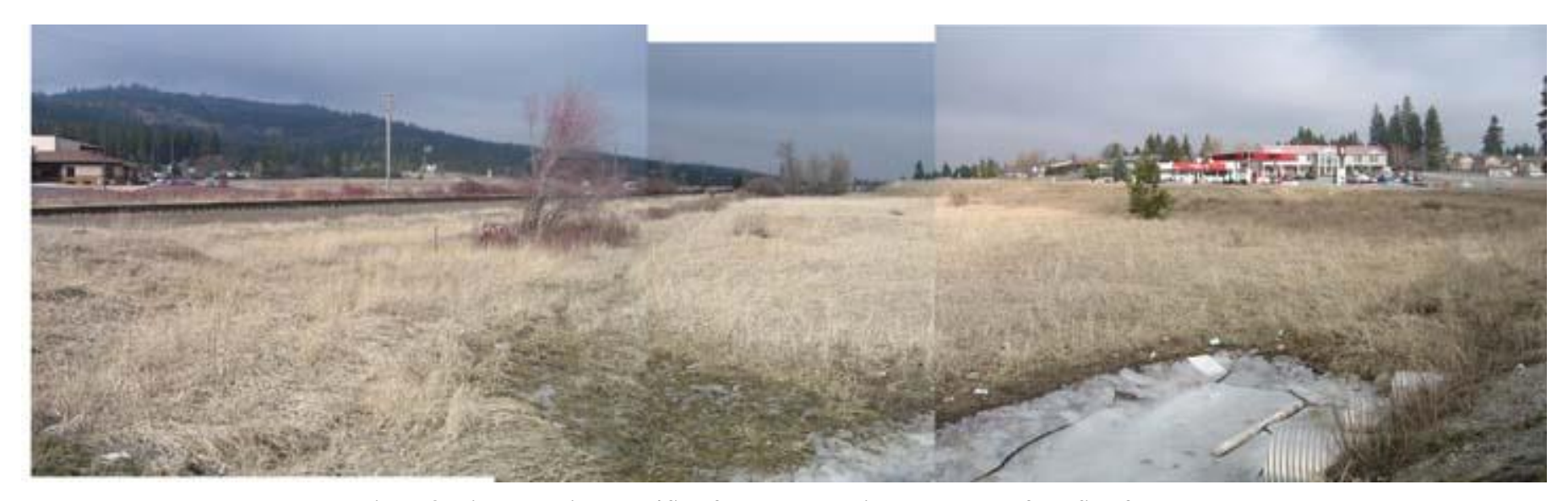
Figure 8: Dishman-Mica Road/ Schafer Road. Looking downstream from Schafer Road