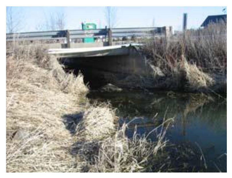
Figure 38: Thorpe road clear span. Looking at upstream bridge face