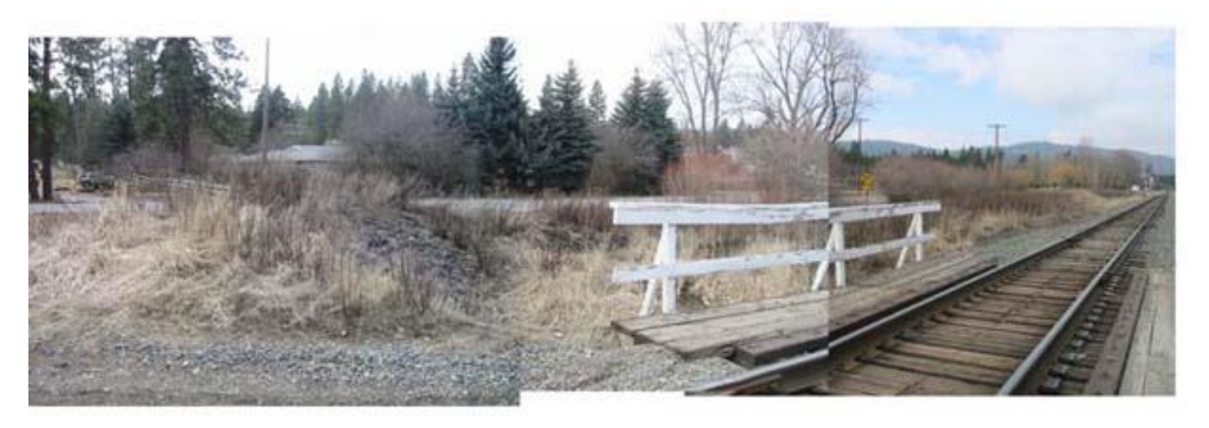
Figure 25: UPRR Bridge about 1/8 mile upstream of Bowdish road. Looking downstream