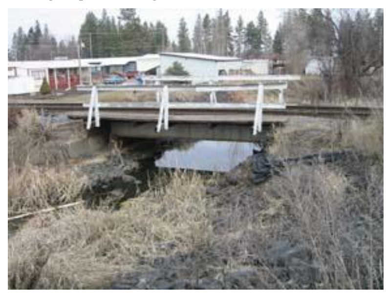
Figure 27: UPRR Bridge about 1/8 mile upstream of Bowdish road. Looking at downstream bridge face