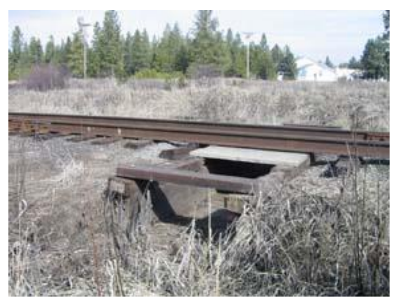
Figure 16: Culvert under railroad between Schafer and Dishman/Mica