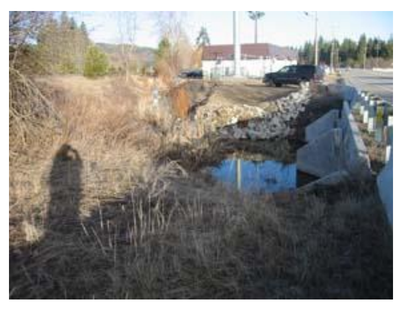
Figure 30: Dishman-Mica road intersection. Looking downstream