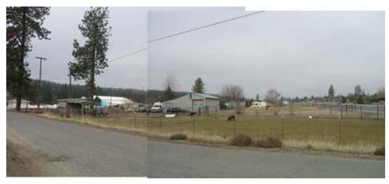
Figure 6: Dishman-Mica Road/28th Avenue Intersection. Looking downstream from 24th Ave.