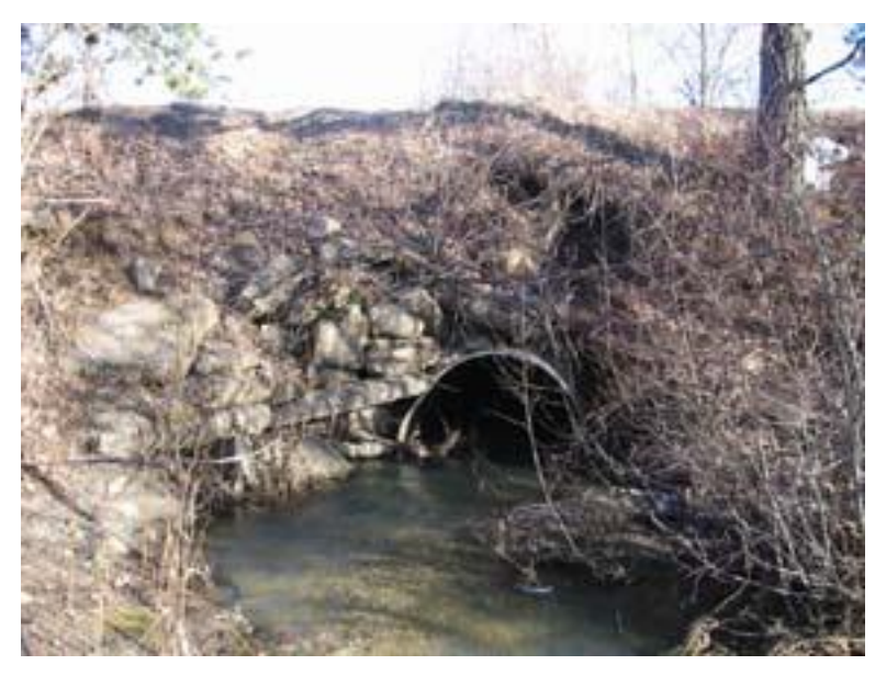
Figure 43: Mohawk road. Looking at upstream face of culvert