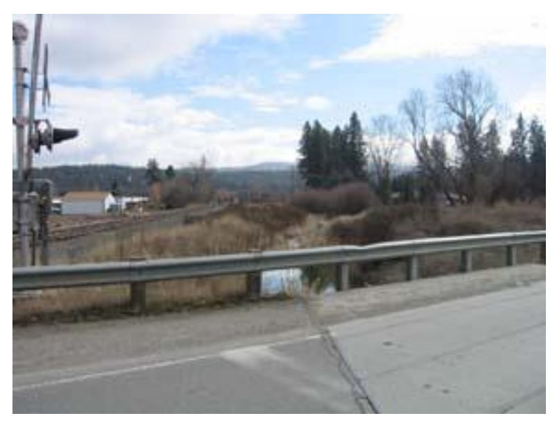
Figure 20: Bridge along Bowdish Road. Looking upstream from bridge