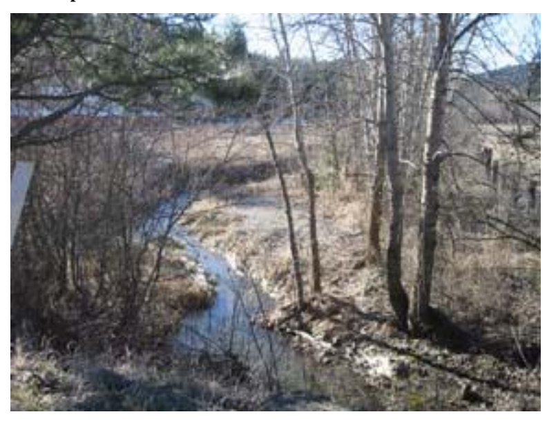
Figure 41: Mohawk road. Looking upstream from road