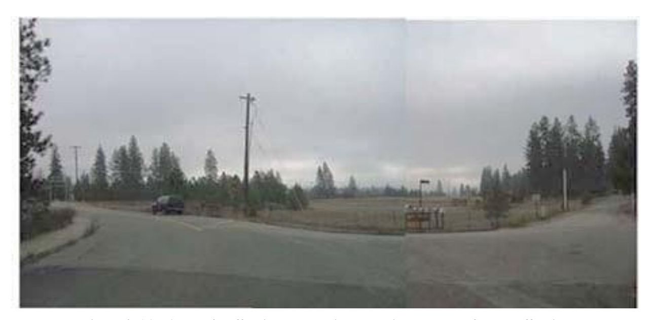
Figure 4: 16th Avenue/Bluff Drive Intersection. Looking upstream from Bluff Drive