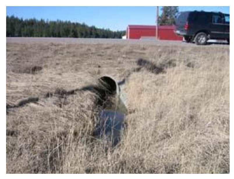
Figure 63: HWY 27 culvert. Looking at upstream face of culvert