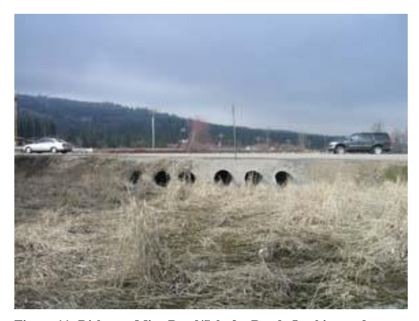
Figure 11: Dishman-Mica Road/Schafer Road. Looking at downstream face of culverts