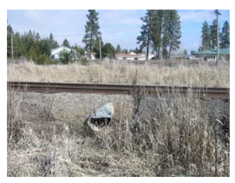
Figure 15: Culvert under railroad between Schafer and Dishman/Mica