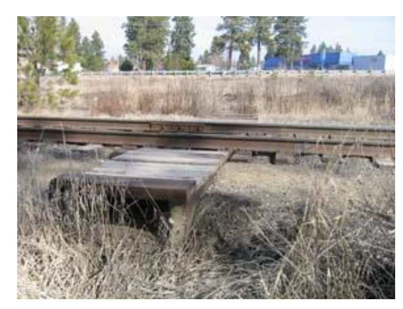
Figure 13: Culvert under railroad between Schafer and Dishman/Mica