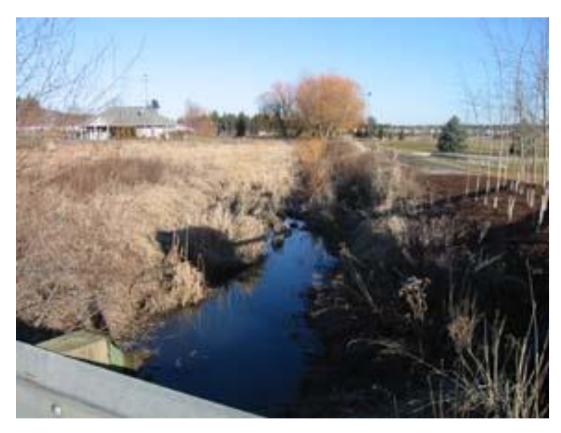
Figure 37: Thorpe road clear span. Looking downstream from bridge