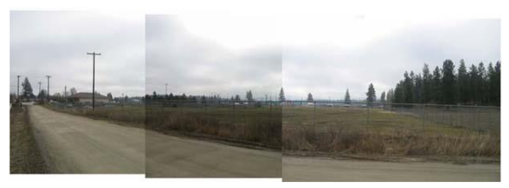
Figure 5: Dishman-Mica Road/24th Avenue Intersection. Looking upstream from 24th Avenue