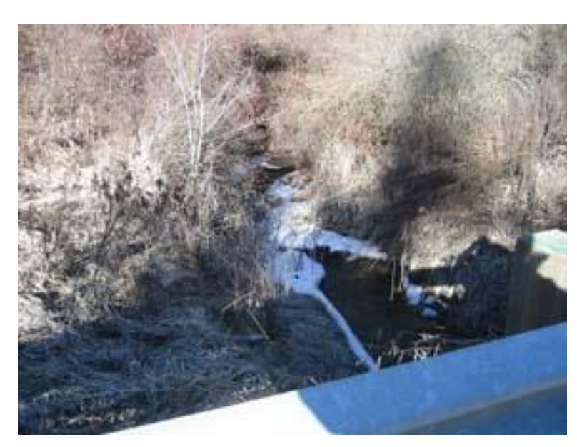
Figure 55: Dishman/Mica Road. Looking downstream