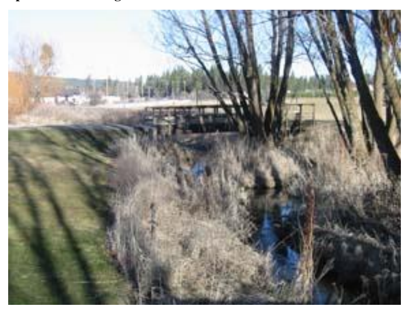
Figure 33: Footbridges on golf course. Looking at upstream face of downstream footbridge