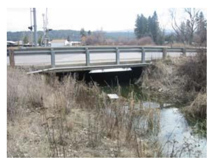
Figure 22: Bridge along Bowdish Road. Looking at downstream face