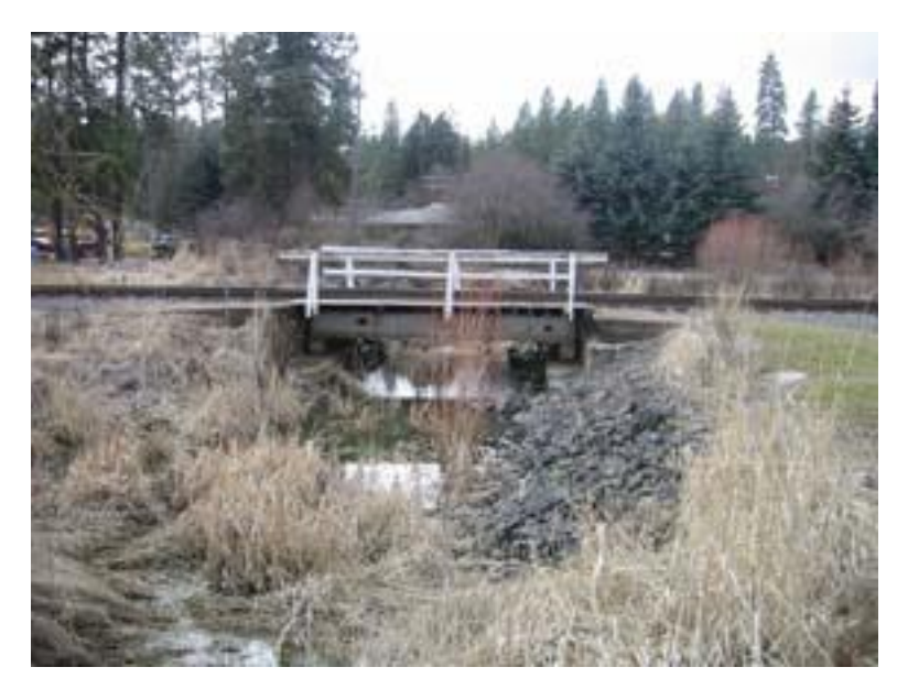
Figure 26: UPRR Bridge about 1/8 mile upstream of Bowdish road. Looking at upstream bridge face