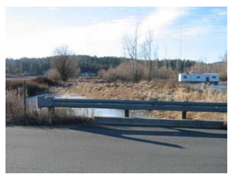
Figure 36: Thorpe road clear span. Looking upstream from bridge