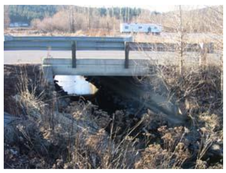
Figure 39: Thorpe road clear span. Looking at downstream bridge face