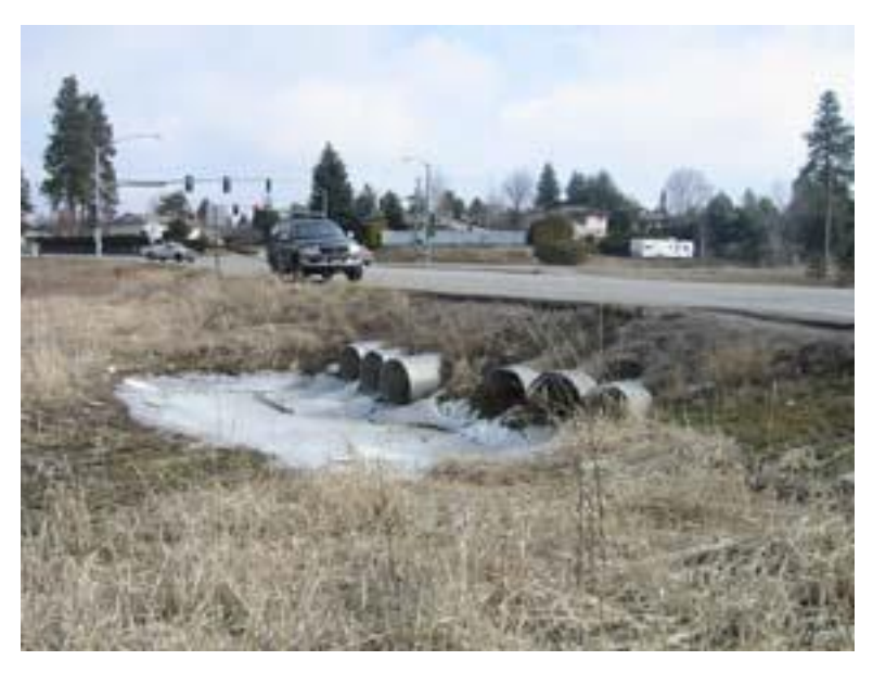
Figure 12: Dishman-Mica Road/Schafer Road. Looking at downstream face of culverts