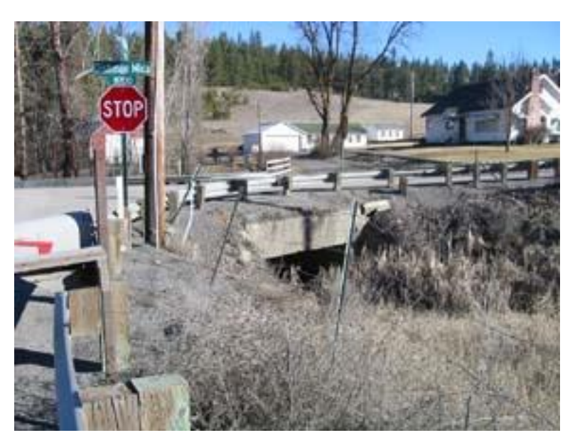
Figure 56: Dishman/Mica Road. Looking at upstream bridge face