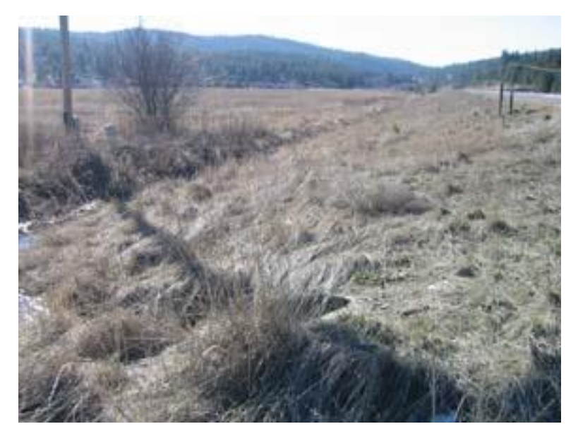
Figure 62: HWY 27 culvert. Looking upstream