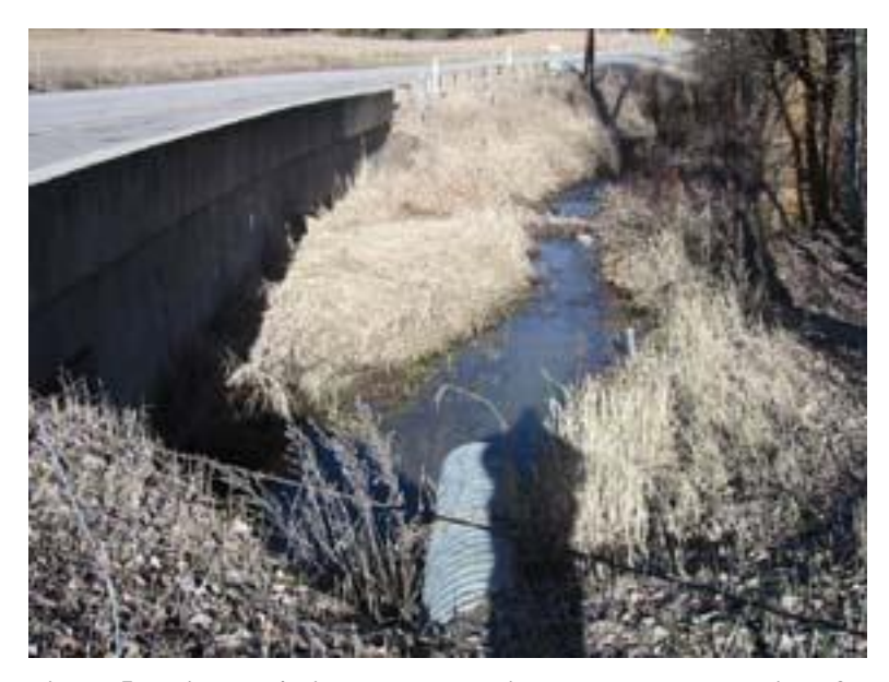
Figure 57: Dishman/Mica Road. Looking at downstream bridge face and downstream channel